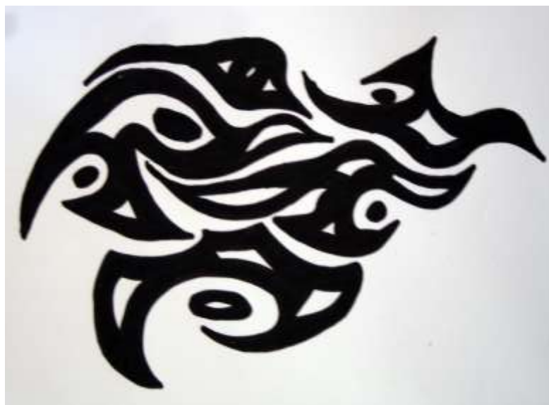
CREATIVE WRITING PROJECT