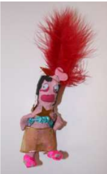
CREATIVE WRITING PROJECT