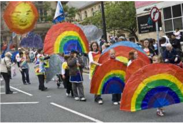
KEIGHLEY GALA PARADE

We entered the gala again this year with an assortment of seasonal weather pieces which gave a colourful splash to the parade.