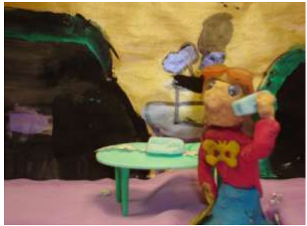
HOLYCROFT SCHOOL ANIMATION

All this and a handful of day events in the community too!