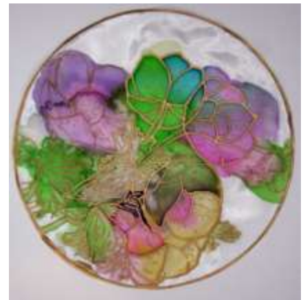
CREATIVE WRITING PROJECT