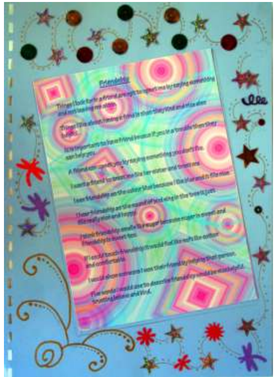
CREATIVE WRITING PROJECT

We have been concentrating on the main Creative Writing Project this year and aiming to extend the development and reach of the organisation through a large bid to the Youth Opportunities Fund & Youth Capital Fund to develop the first floor