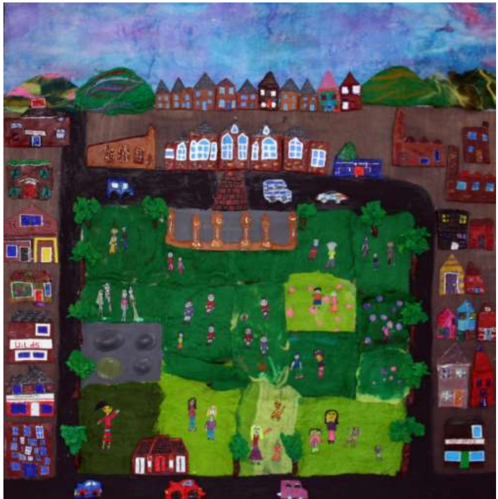
HOLYCROFT SCHOOL MULTI-MEDIA MURAL