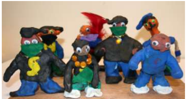
HOLYCROFT SCHOOL ANIMATION