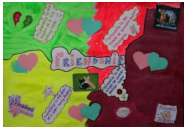
CREATIVE WRITING PROJECT